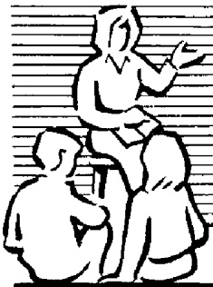
9 Talking to pupils