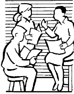
3 Assisting teachers and ancillaries