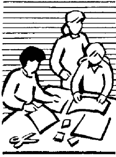
1 Working in a classroom