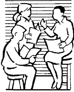
3 Assisting teachers and ancillaries