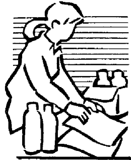
6 Preparing art and play materials