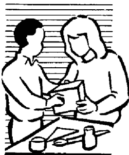
8 Supporting pupils with their work