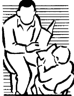
4 Reading to and with pupils