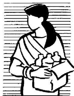
10 Helping to keep work places tidy