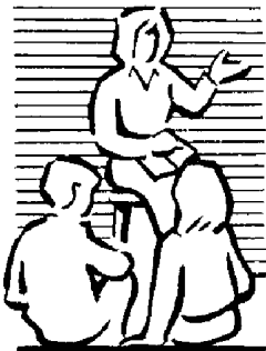
9 Talking to pupils