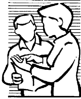
2 Observing staff